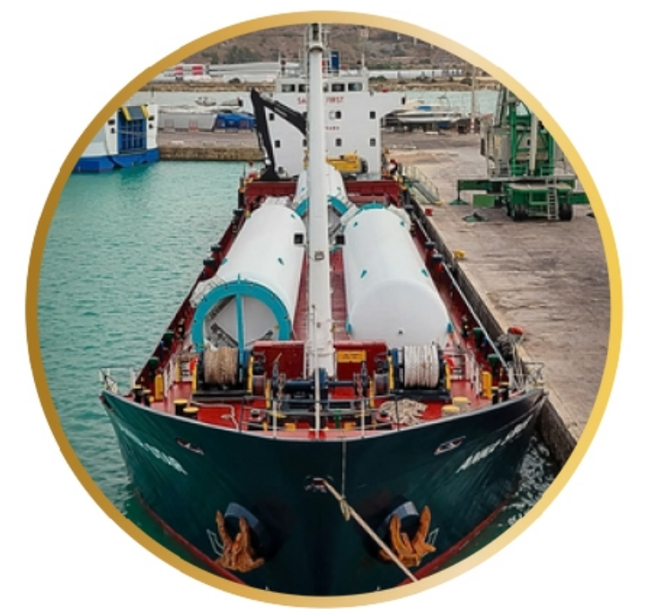
MV ANKA Star