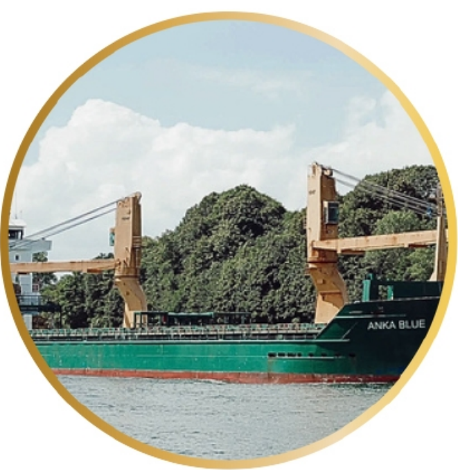
MV ANKA Blue