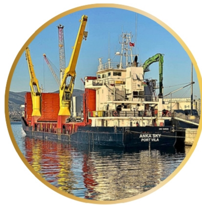
MV ANKA Sun